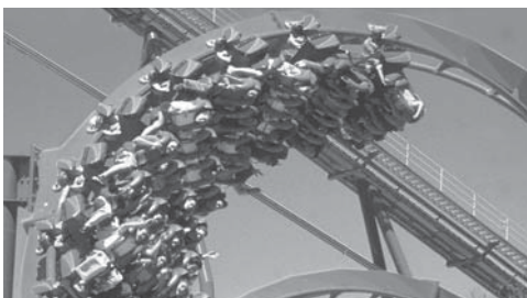
Six Flags Fiesta Texas

We hope you will consider San Antonio and OLLU as you plan for your future