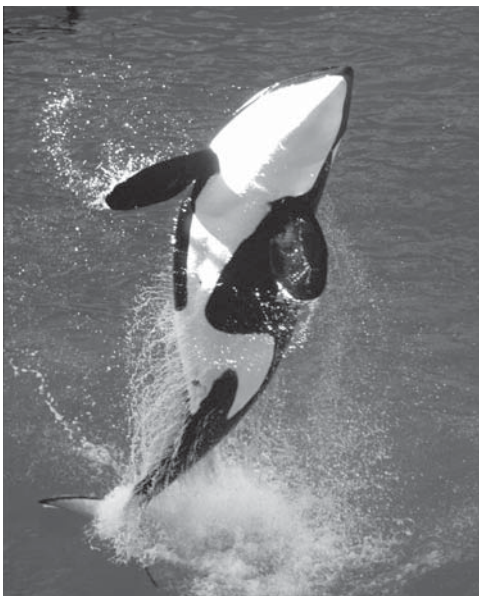
SeaWorld San Antonio