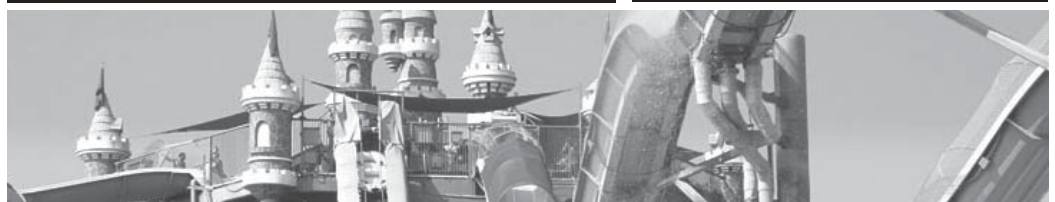
Schlitterbahn Water Park Resort – New Braunfels