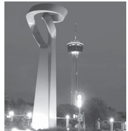
Torch of Friendship - Tower of Americas