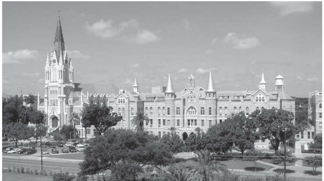
Our Lady of the Lake University