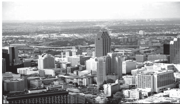
Downtown San Antonio